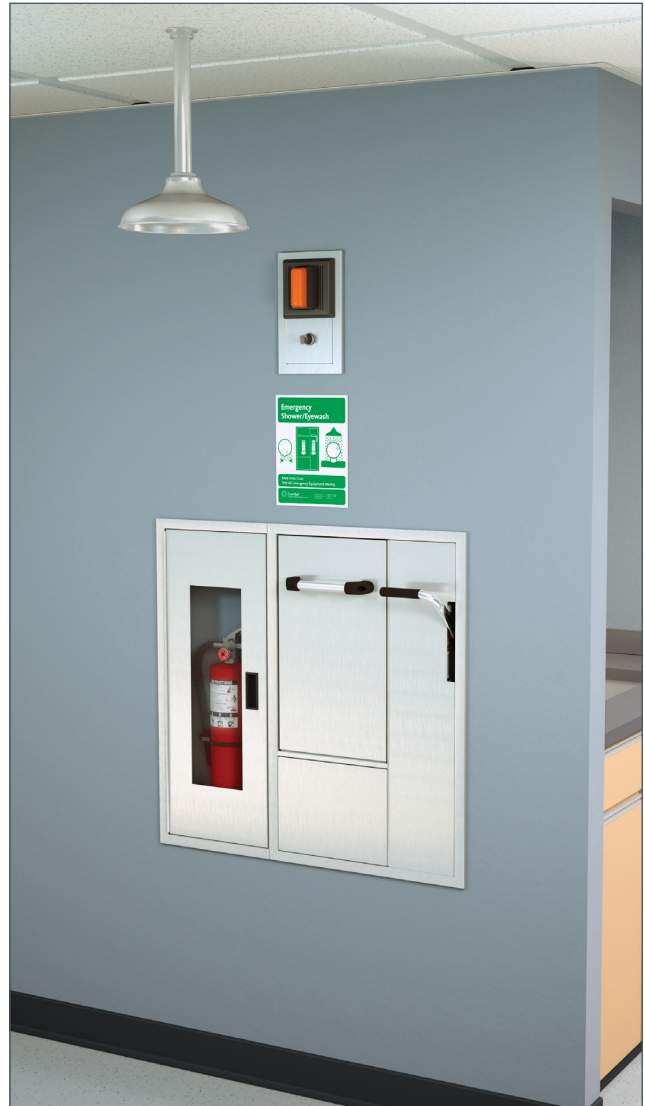
Note: Shown with optional AP280-237 electric light and alarm horn unit with silencing switch. (Fire extinguisher sold separately)